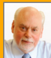
Sir J. Fraser Stoddart

Università di Parma, Italy C. D. Gutsche Award