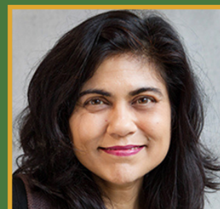
Veena Sahajwalla Revolutionising recycling

To submit an abstract or book your ticket CLICK HERE