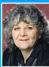
Ada Yonath 2009 Nobel Prize Winner