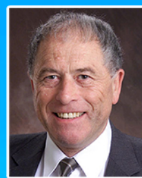
Kurt Wüthrich 2002 Nobel Prize Winner