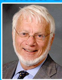
Thomas Steitz 2009 Nobel Prize Winner