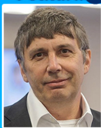
Andre Geim 2010 Nobel Prize Winner