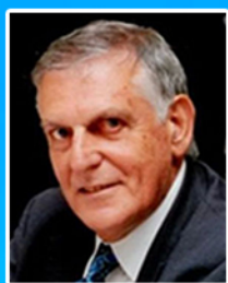
Dan Shechtman 2011 Nobel Prize Winner