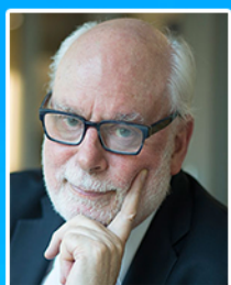
Fraser Stoddart 2016 Nobel Prize Winner