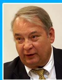
Ferid Murad 1998 Nobel Prize Winner