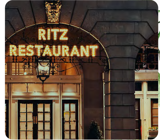
In front of The Ritz