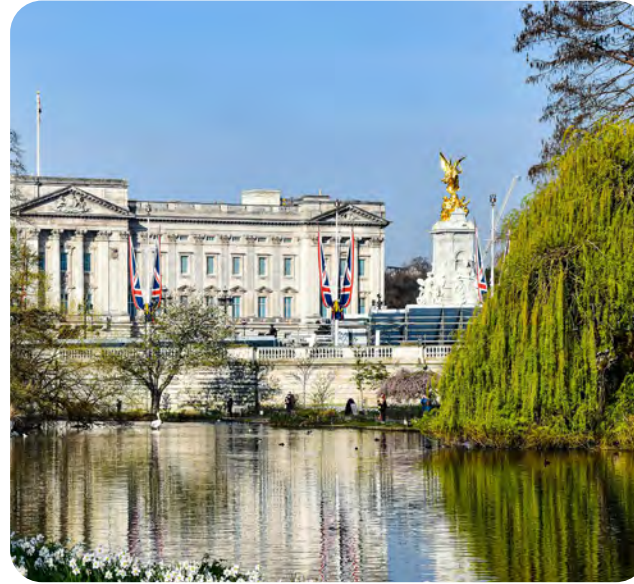
St. James Park