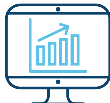
COUNTER compliant usage stats