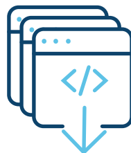
Multiple download formats including HTML and ePUB

For more information, please contact your account manager or email sales@rsc.org