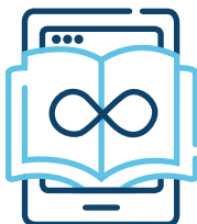
Unlimited eBook usage