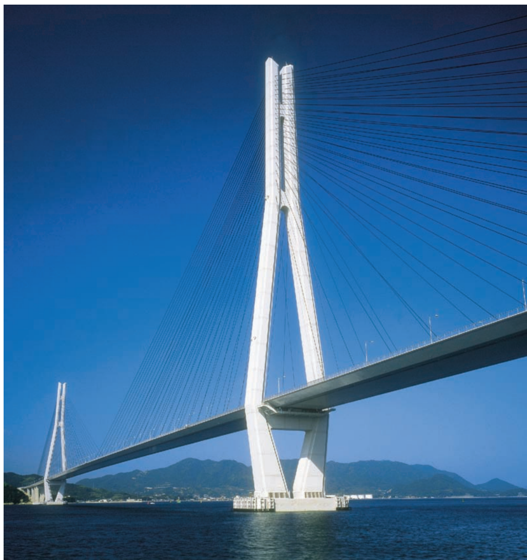
The Tatara bridge in Japan is the world's longest cable-stayed concrete bridge

'Replacement of Portland cement is key, absolutely, and the challenge is to address the negative effects of this substitution, which is mainly related to early strength development,' said Hübsch. 'With 50 per cent clinker replacement with fly ash, early strength goes down dramatically. We had a discussion with the big contractors in Germany about this – ideally they would like to cast concrete in the afternoon, and then de-mould the next morning, to go on with the construction. At colder temperatures this can really