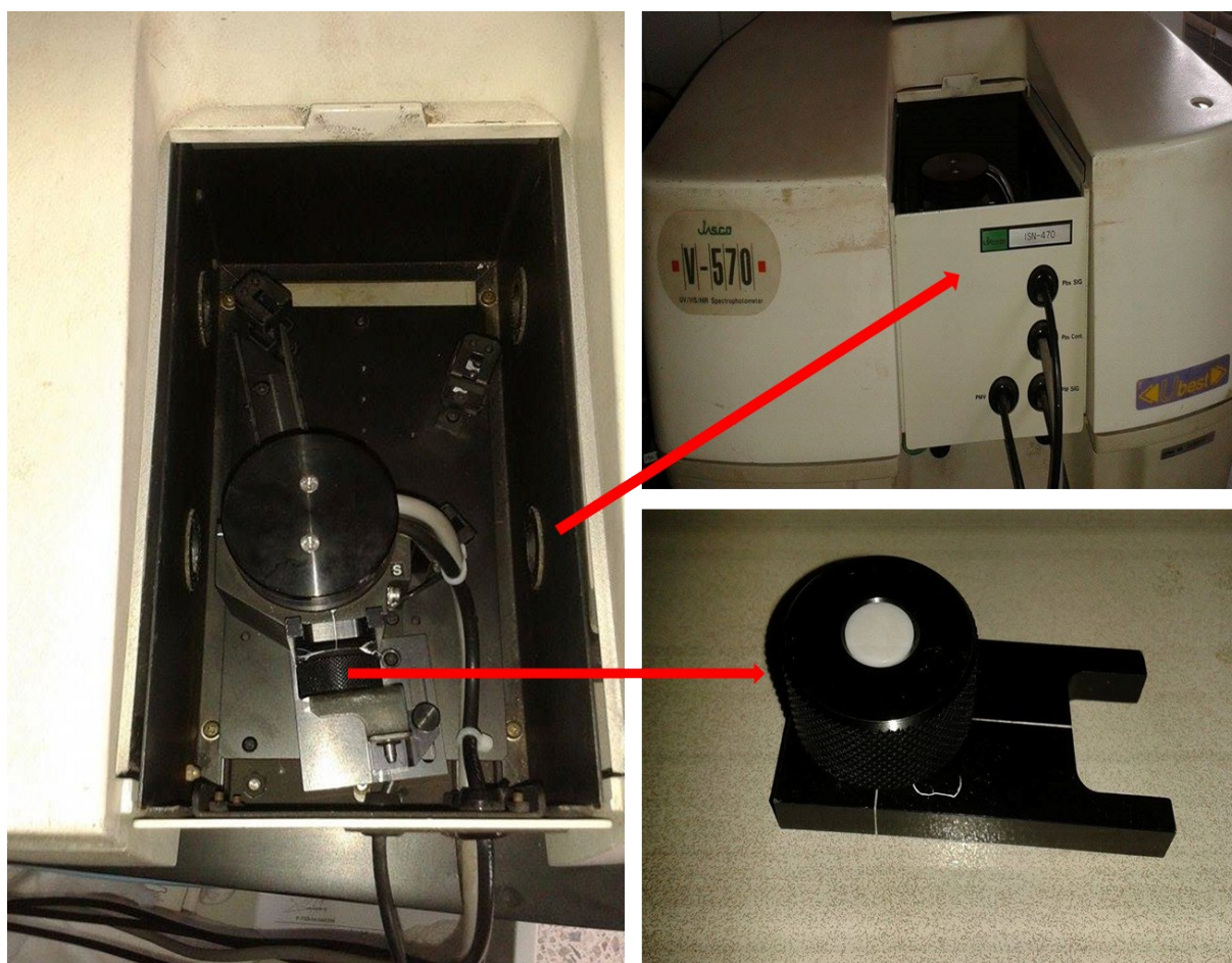
Figure SI1. The Integrated sphere unit in the UV-Vis-NIR-scanning spectrophotometer (JASCO V-570 spectrophotometer, Japan)

SI1. The integrated sphere unit of Optical band gap measurements