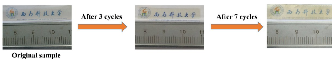
Figure S2. The photo pictures of original PSVP-Zn strips and that after 3 and 7 cycles.