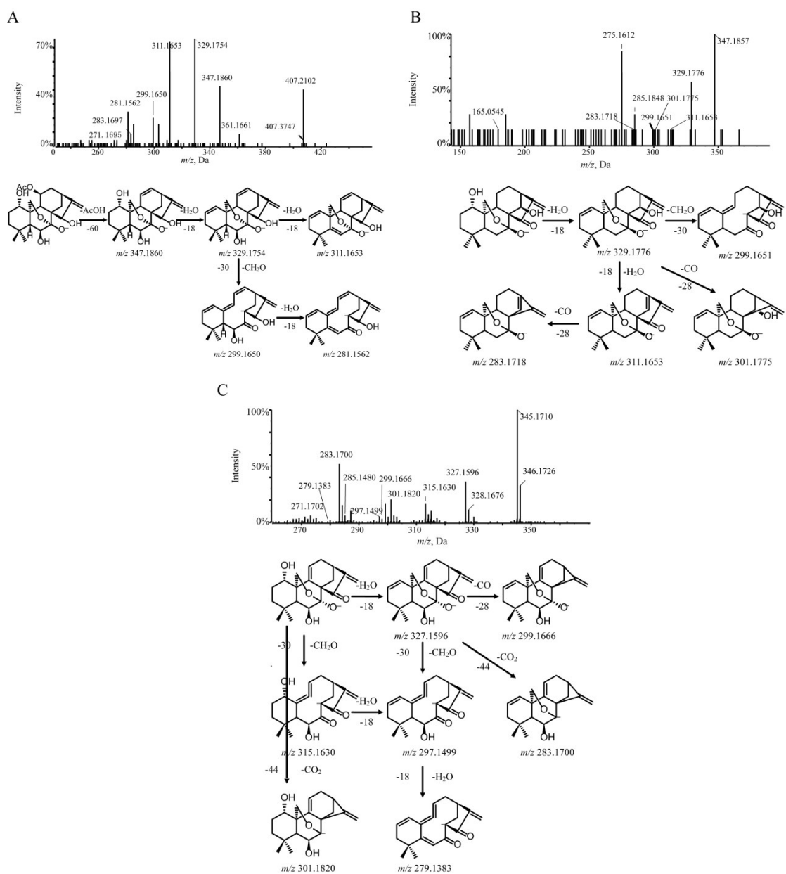
Fig. S3. MS/MS spectra and cleavage pathways of compounds 7 (A), 15 (B) and 20 (C).