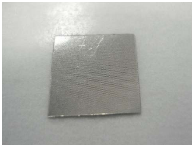
Fig. S1 Photographs of (a) confined PFSA-zeolite composite membrane and (b) corresponding MEA.

SEM images of SSM with zeolite film were made using a JEOL JSM-6300F field-emission scanning electron microscope. Olympus BX41 Microscope with fluorescence accessories was used to observe integrity of confined PFSA-zeolite composite membrane. DSC curves of recasted Nafion and confined PFSA-zeolite composite membranes in compressed air from room temperature to 573 K (ramp rate: 5 K·min -1 ) were measured using a TA Q1000 differential scanning calorimeter. The samples were pre-dipped into DDI water overnight. Before measurement, the samples were wiped with weighing paper to remove water drops on surface and cut into small pieces with the size of 2 mm×2 mm. SEM images with EDX line scan and EDXS of confined PFSA-Sil-1 composite membrane were recorded in a JEOL JSM-6300 scanning electron microscope equipped with high-sensitive energy dispersive X-ray detector. ToF-SIMS mapping images of confined PFSA-Sil-1 composite membrane were made by an ION-TOF GmbH TOF-SIMS V spectrometer equipped with 25 keV Bi 3 + cluster ion source that has an average pulsed current of 0.1 pA. The sample was fixed on Si wafer with double sided carbon conductive tape.