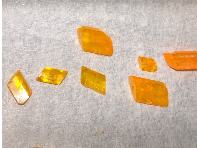
Figure S2: Close up of several single crystal samples following harvest.