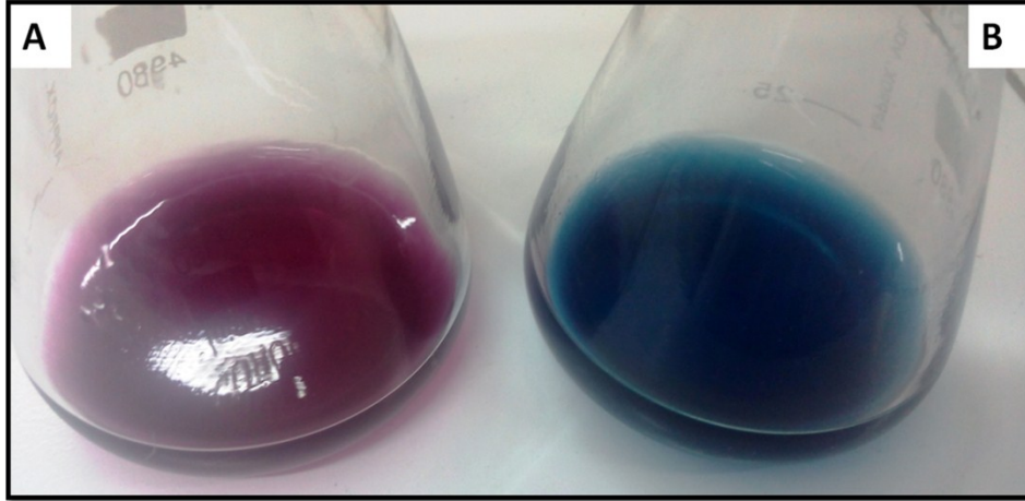
Fig. S2: Quantitative estimation of calcium carbonate (A) Before titration; (B) After titration