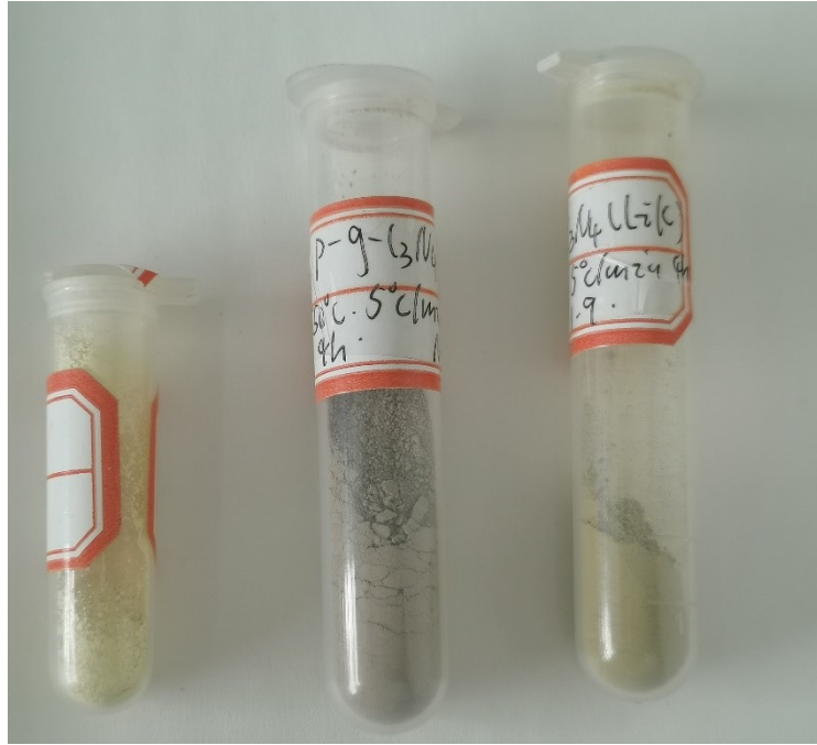
Fig. S3. Digital photographs of the as-prepared g\text{-C}_3\text{N}_4 and \text{P-g-C}_3\text{N}_4 and \text{PCN}_x samples