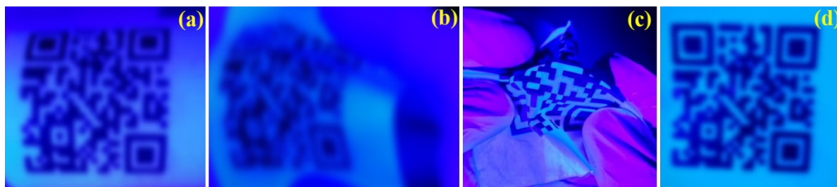
ESM 3. Photographs of the QR code security label (a, b) folding and (c) crushing (d) wetting assay under UV light. The photographs of the QR code and currency were blurred to avoid copyright issues.