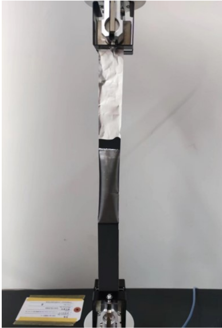
Figure S1. Peel Test Chart.