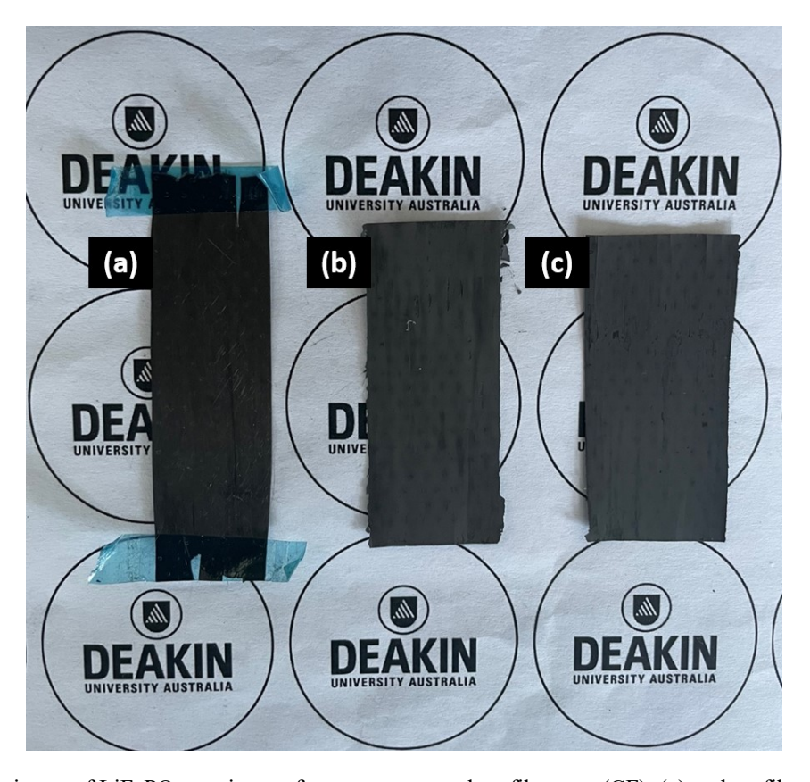
Figure S1. A picture of LiFePO<sub>4</sub> coating performance onto carbon fibre tow (CF); (a) carbon fibre tow substrate which is fabricated PVDF binder prior to coating LiFePO<sub>4</sub> (b) 90 LiFePO<sub>4</sub>/CF and (c) 78 LiFePO<sub>4</sub>/CF.

*Corresponding Author: minoo.naebe@deakin.edu.au