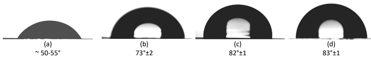
Figure S2 – CA of pristine PET TeM (a) and PET TeMs-g-PLMA with a grafting degree – 0.62% (b), 1.74% (c), 3.2% (d)