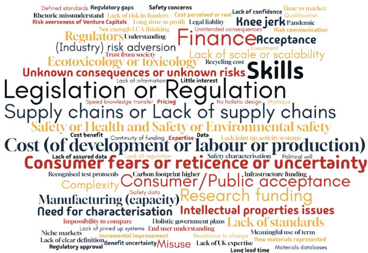
Figure S3. Word cloud response to question - What are the barriers to commercialisation of advanced materials? (122 responses). Note that limited preprocessing of responses was undertaken prior to generating word clouds to group similar terms and harmonise.