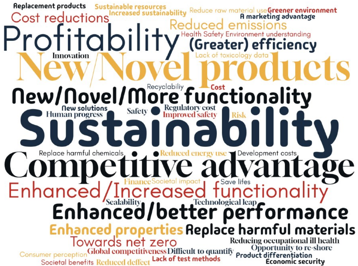
Figure S2. Word cloud response to question - What are the benefits to commercialisation of advanced materials? (84 responses). Note that limited preprocessing of responses was undertaken prior to generating word clouds to group similar terms and harmonise.