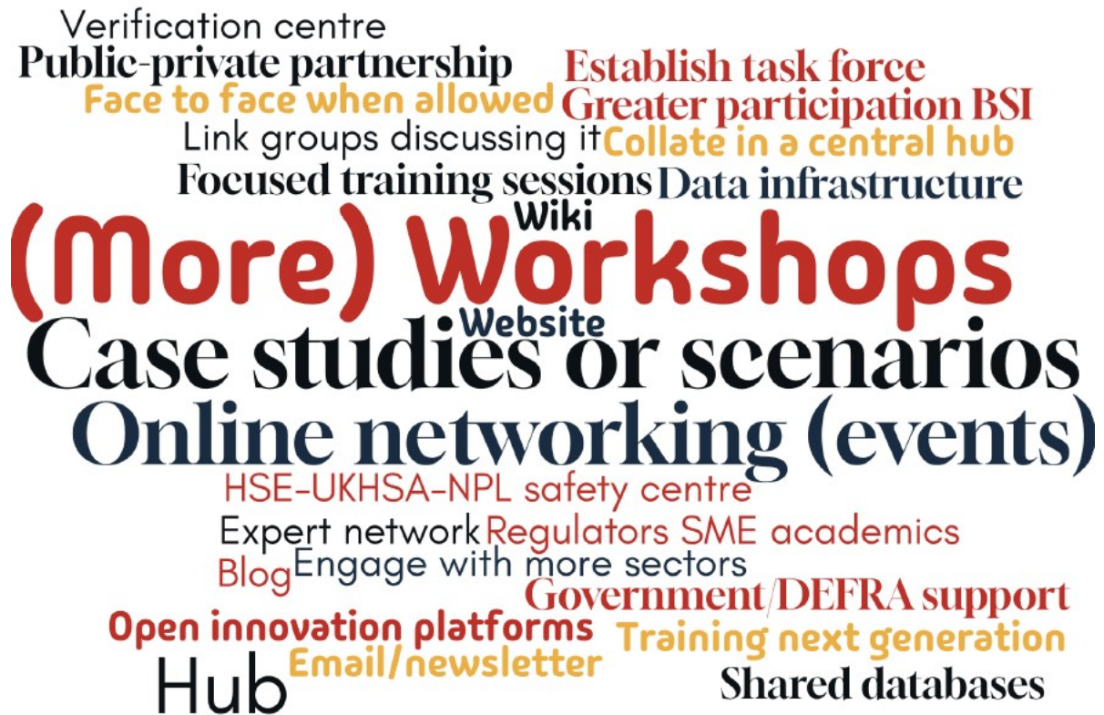
Figure S5. Word cloud response to question – How can we more effectively exchange information about this subject? (33 responses). Note that limited preprocessing of responses was undertaken prior to generating word clouds to group similar terms and harmonise.