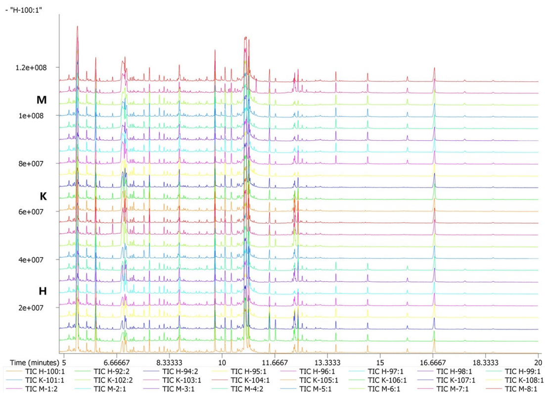
Fig. S1. GC-TOF/MS total ion chromatogram of all serum samples.

Note: M: Model group; K: Control group; H: High-dose polyphenols group, the same below.