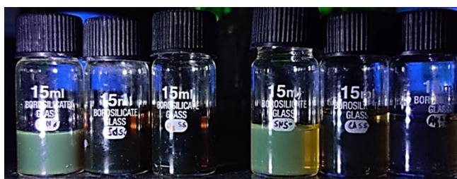
Figure S1. Represents the camera image acquired AI-CDs-1 treated with: a1) only CDs (untreated), b1) with \text{Cd}^{2+} and c1) with \text{As}^{3+} and AI-CDs-2 treated with a2) only CDs, b2) with \text{Cd}^{2+} and c2) \text{As}^{3+} .