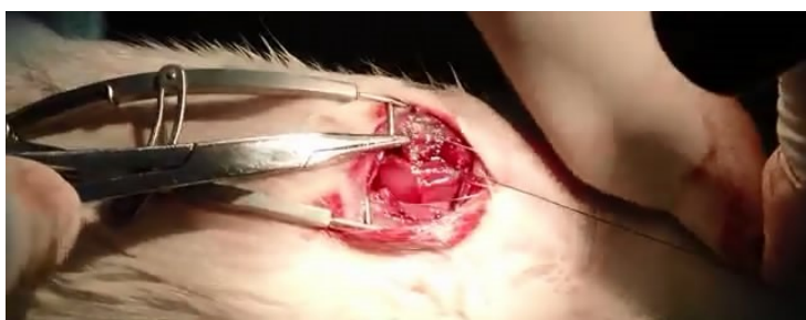
Figure S2. The construction of MI model on rat heart