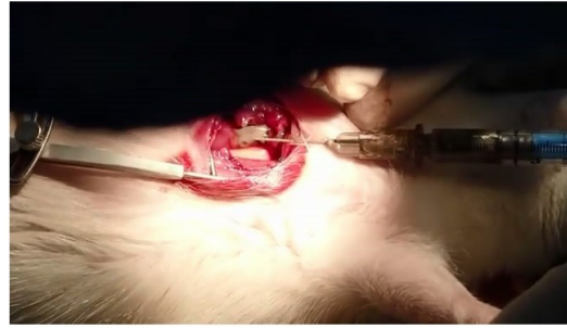
Figure S3. Before and after SA/LM/TA injection in pericardial cavity.