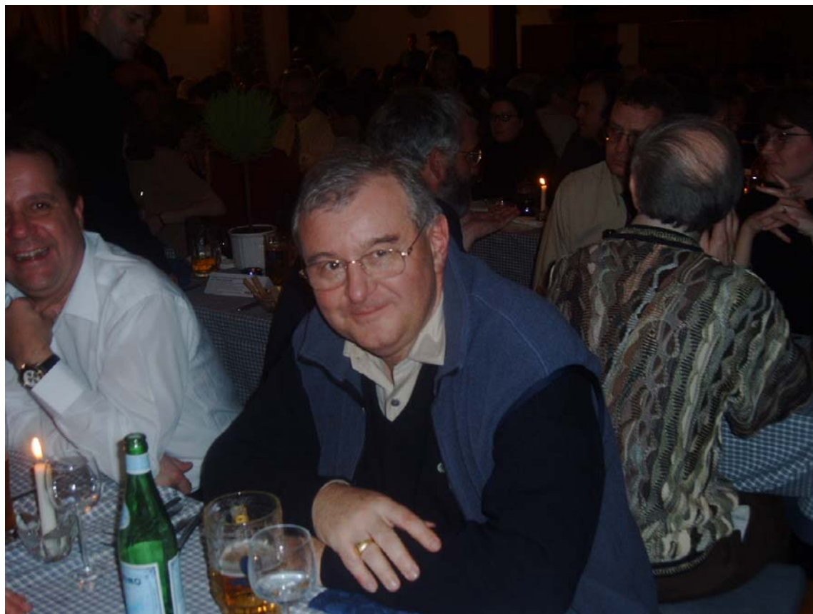
European Winter Conference on Plasma Spectrochemistry 2003 in Garmisch (Bavarian Evening)