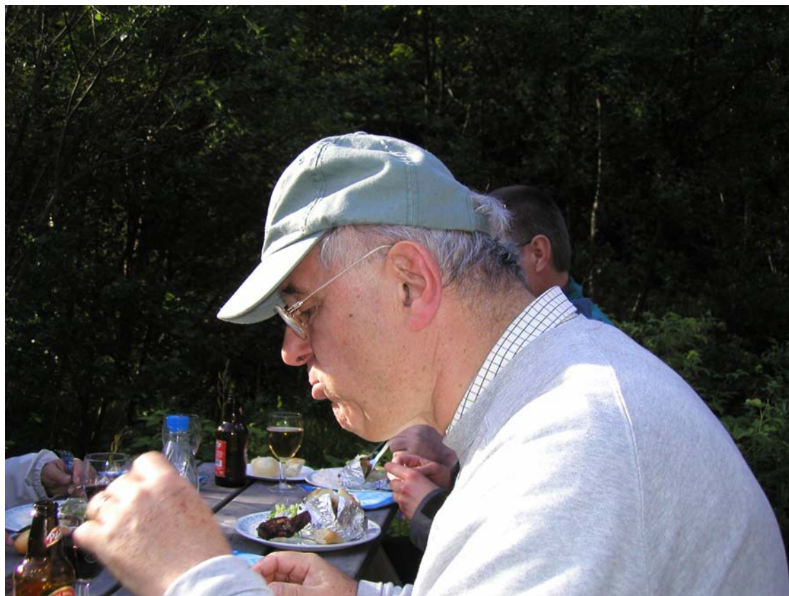
2004 Nordic Conference on Plasma Spectrochemistry in Loen/Norway at the open air grill party