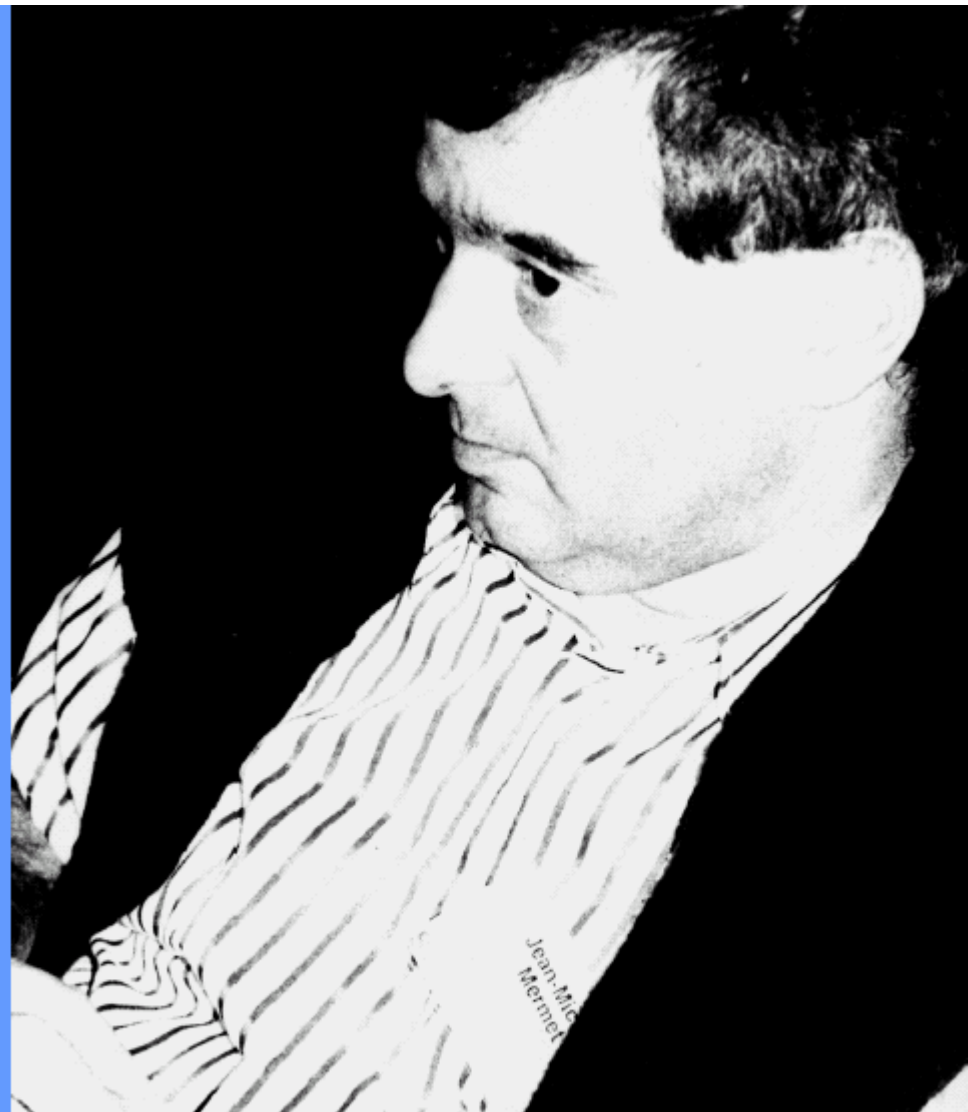
1990 Winter Conference on Plasma Spectrochemistry St. Petersburg, Florida