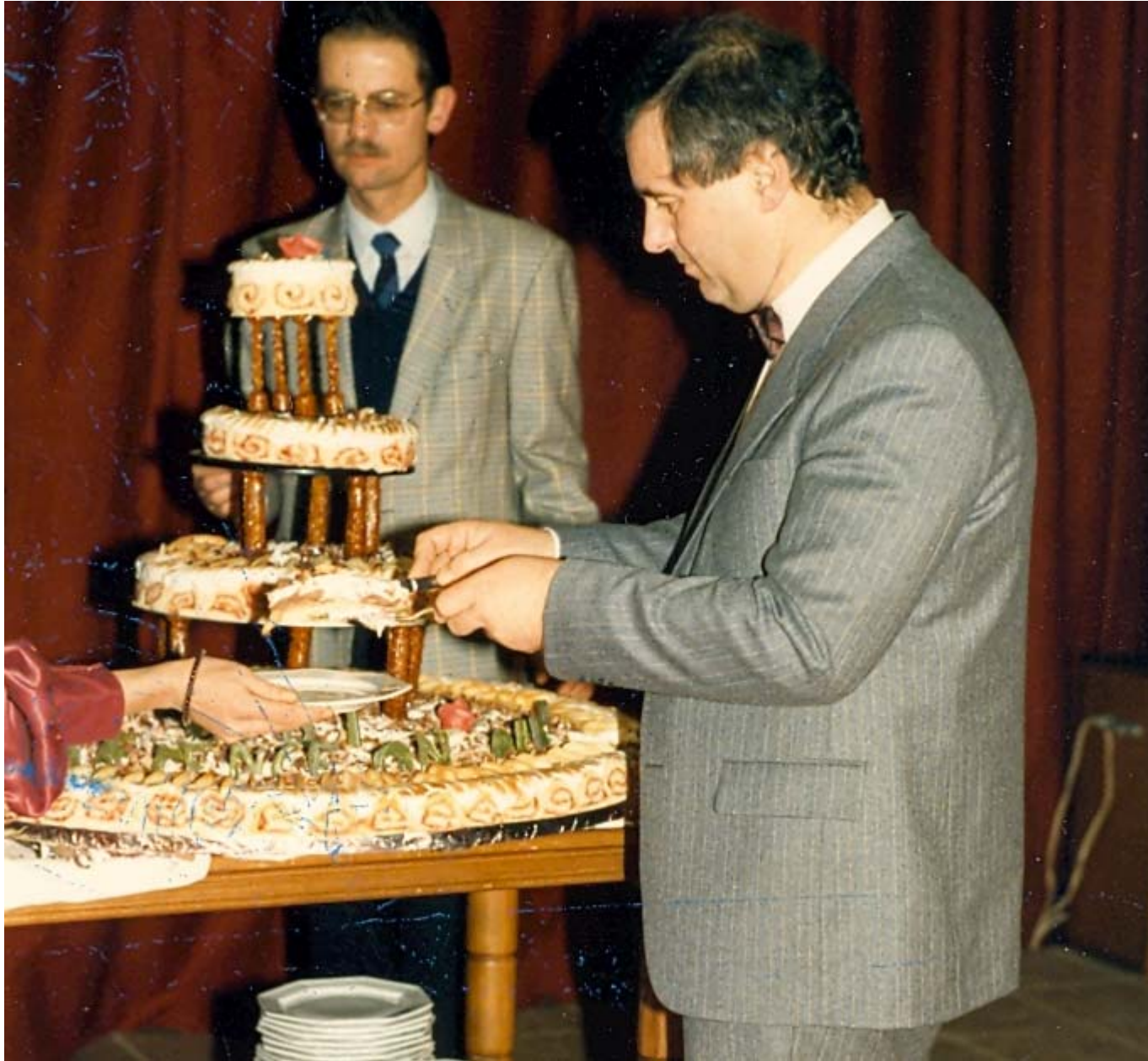
The amazing dessert at the Lyon Winter Plasma Conference, 1987.