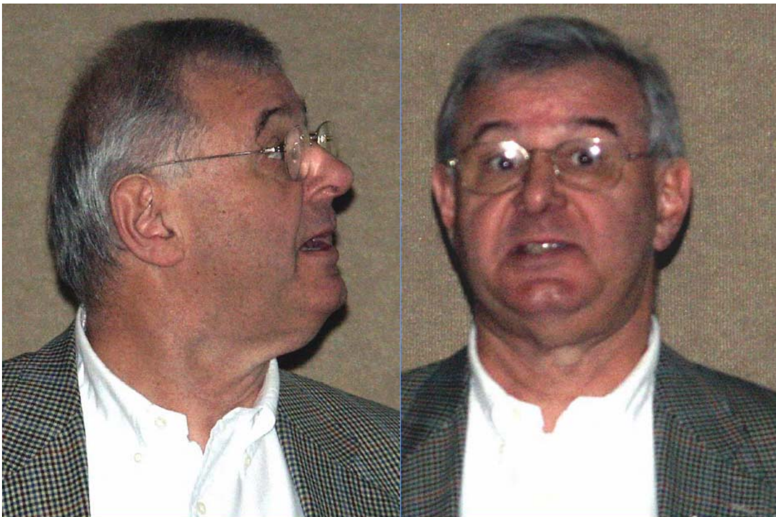
2004 Winter Conference on Plasma Spectrochemistry Fort Lauderdale, Florida

This seems to be taken from the police files!