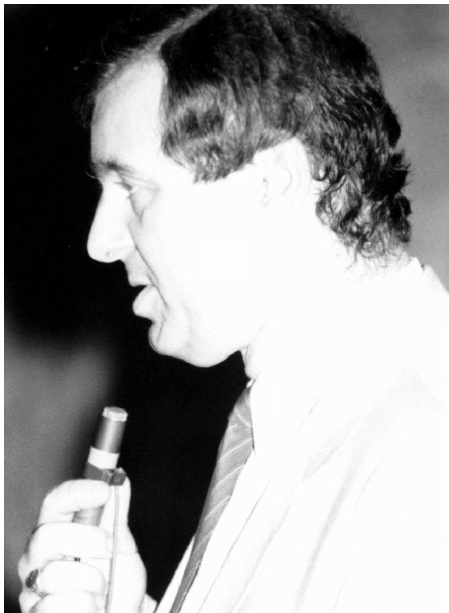
1984 Winter Conference on Plasma Spectrochemistry San Diego