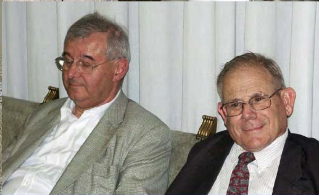
Pre-CSI Symposium, Zaragoza, Spain, September 2003