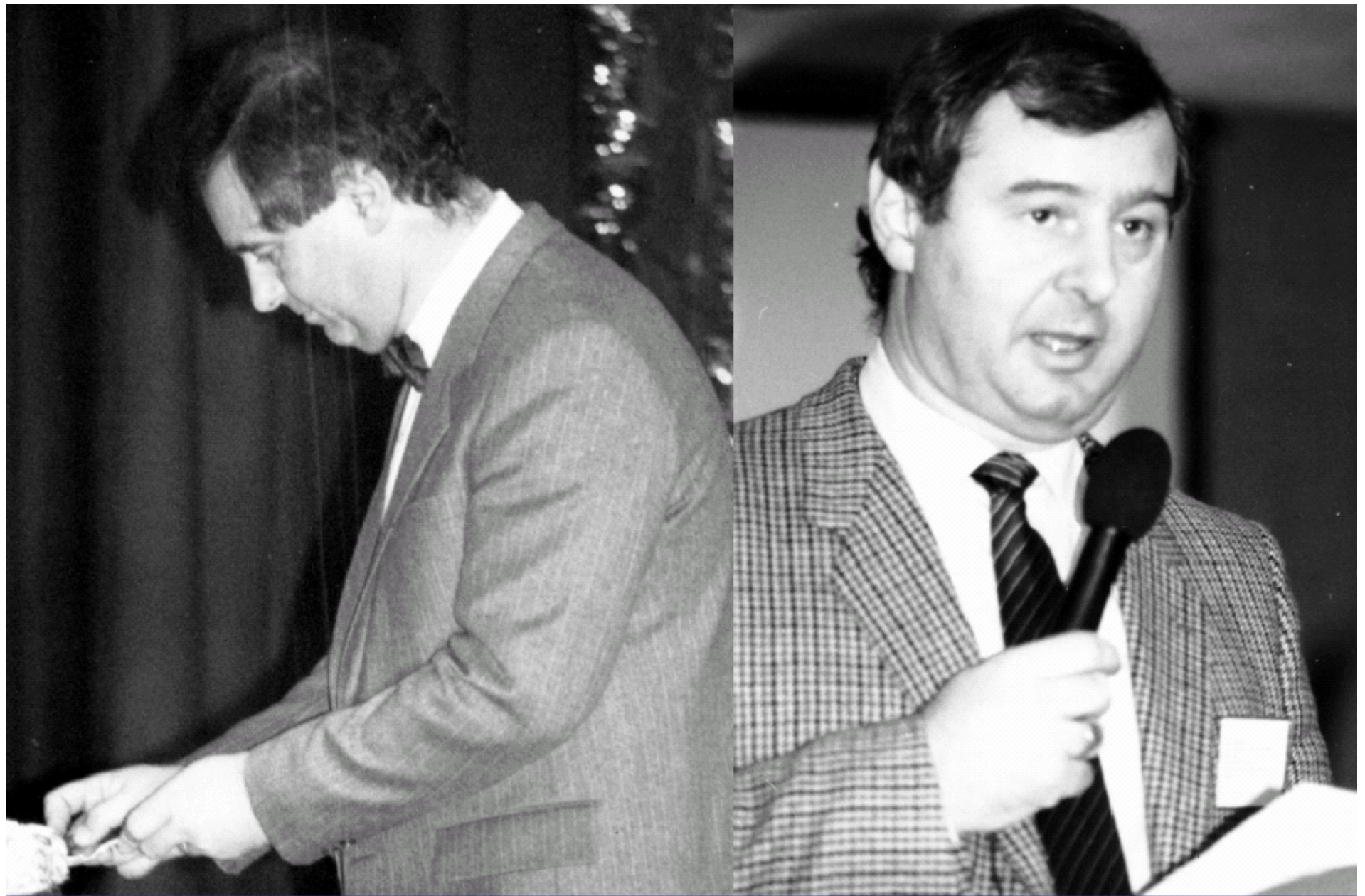
1987 European Winter Conference on Plasma Spectrochemistry, Lyon, France