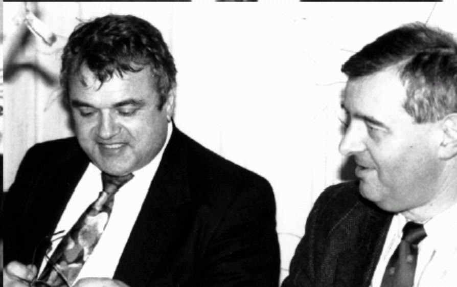
1991 European Winter Conference on Plasma Spectrochemistry, Dortmund, Germany